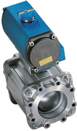
4" ball valve with actuator