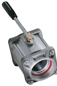
3" ball valve