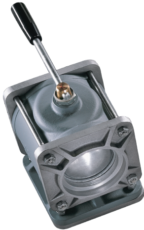
4" ball valve