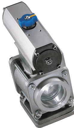
3" ball valve with actuator