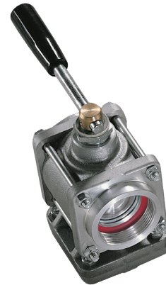
2" ball valve