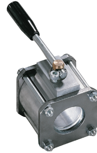
2" ball valve