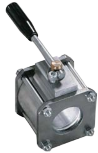
2" ball valve