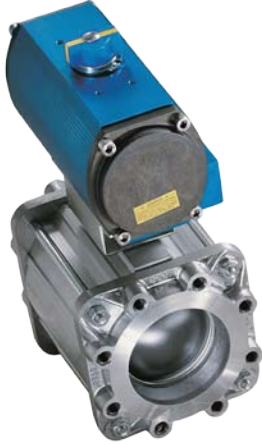
4" ball valve with actuator