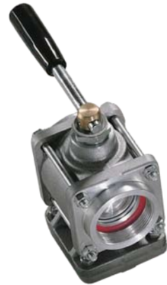
2" ball valve