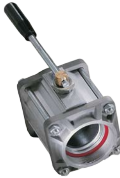
3" ball valve