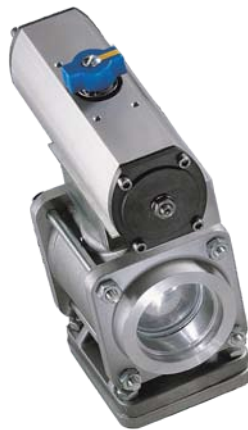
3" ball valve with actuator