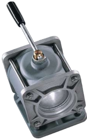
4" ball valve